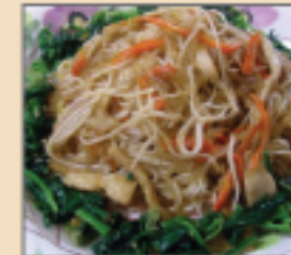
72. Jabchae Bokum