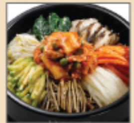
32. Kimchi Dolsot Bibimbab