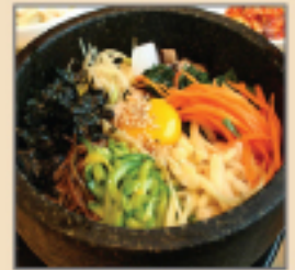
30. Dolsot Bibimbab