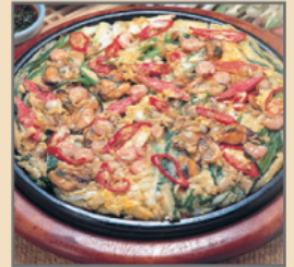
5. Haemul Pajeon