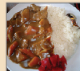
76. Vegetable Curry Rice