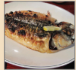
56. Godeungeo Gui