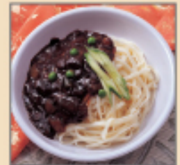
62. Cha Jang Myun