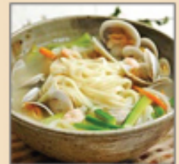
58. Haemul Kalguksu