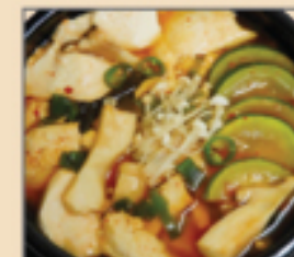
74. Mushroom Soon Tofu Stew