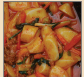
10. Bulgogi Topokki