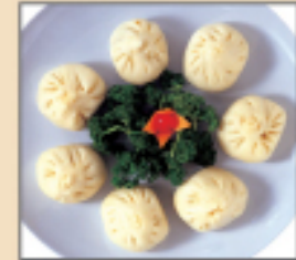
70. Yachae Chin Mandoo