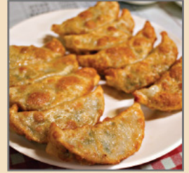
3. Gun Mandu