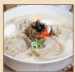
50. Tteok Mandu Guk