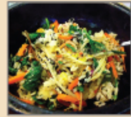
69. Yachae Dolsot Bibimbap