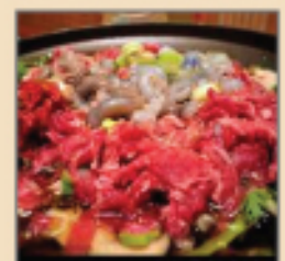
65. Bulnack Jeongol