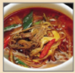
48. Yuk Gae Jang