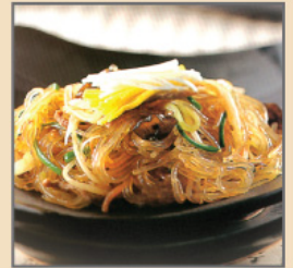
8. Jap Chae