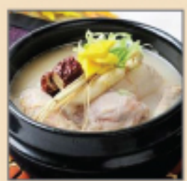
53. Sam Gae Tang